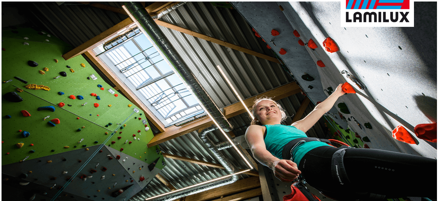
Climbing Centre OWL, Brakel