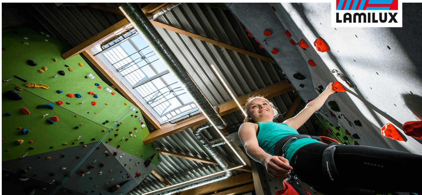
Climbing Centre OWL, Brakel