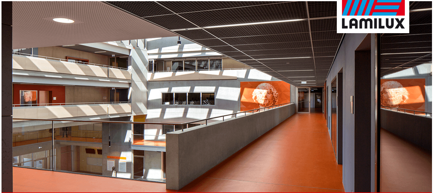
Willibald-Gluck Secondary School, Neumarkt i.d. OPf.